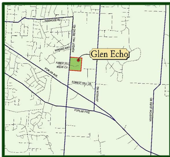
Detailed Vicinity Map

For Information Regarding this Estate Neighborhood, Please Contact: Douglas Swink (901) 826-2700